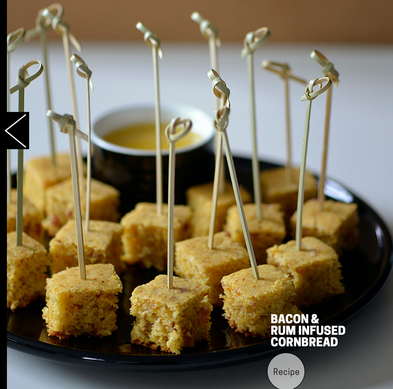
BACON & RUM INFUSED CORNBREAD