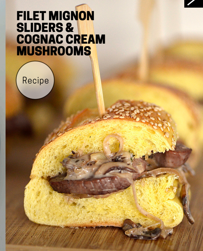
FILET MIGNON SLIDERS & COGNAC CREAM MUSHROOMS